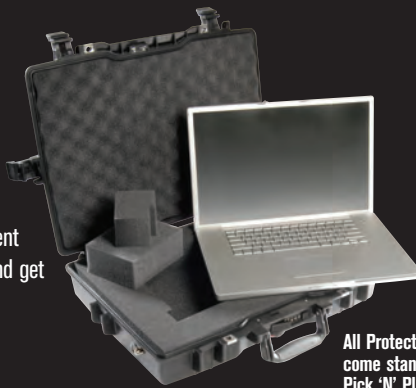
All Protector™ Cases come standard with Pick 'N' Pluck™ foam.

Pelican's Pick 'N' Pluck™ foam lets you customize the interior according to your gear. An easy, do-it-yourself system for custom-shaping the interior of the case according to your equipment. Layers of foam are pre-scored in tiny cubes. Simply measure your equipment over the grid and pluck away. Contents stay in place and get extra protection at the same time.