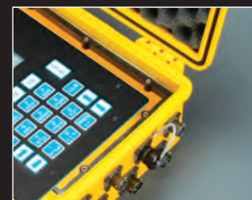
Panel frame mounting system

Customize your case to hold electronic interface panels, or create the perfect protection insert for your equipment. Close the lid and see your logo applied as a decal or hot stamp (call for details).