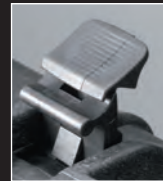
New Stronger Double-Throw Latch

The Pelican Protector™ Case uses an open cell core and solid wall construction, which is actually stronger and lighter than a solid core wall. Travel light with heavy protection. And you know it's a Pelican™ Case by the distinctive dual band top surface. Stainless steel pins are used for hinges and handles. The new Double-Throw latches are smarter and easier to open: it's the classic 'C' clamp design with a secondary movement that works like a pry bar to start the release and offers plenty of leverage to open with a light pull.